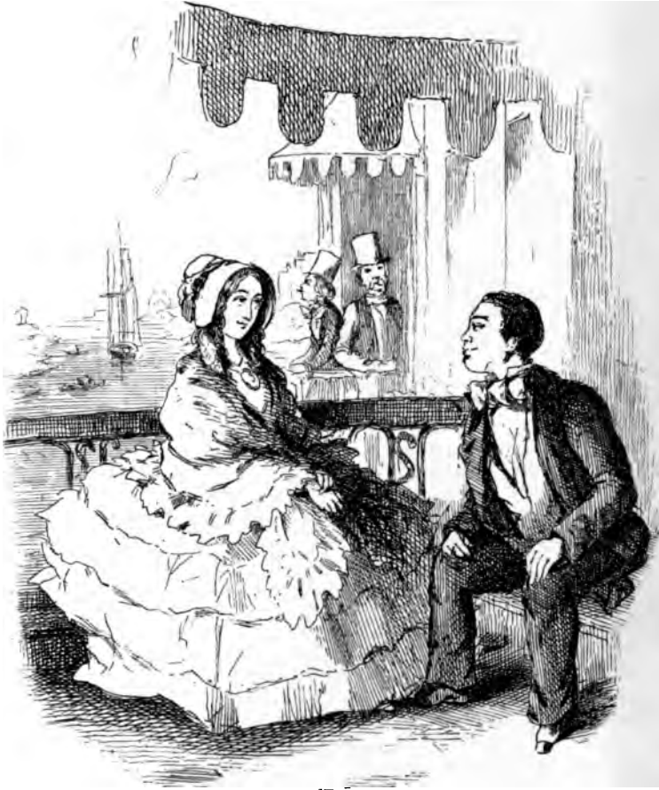
ALMOST PERFECT HAPPINESS